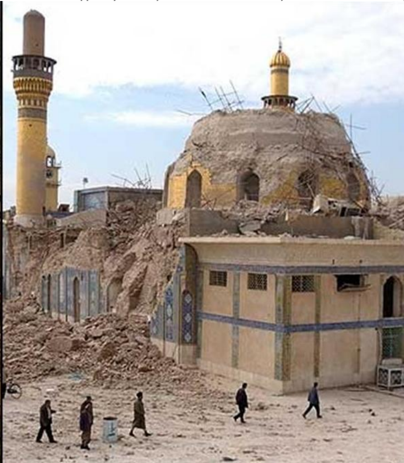
Samara after 2003

heritage, phosphorus homes, of heritage, phosphorus schools, of AGRICULTURE. Abu Ghraib The WATER treatment irrigation system IMPUNITY plants, of the detention. GUANTANAMO system, of uprooting 1 000 000 LIVELIHOOD TREES. De