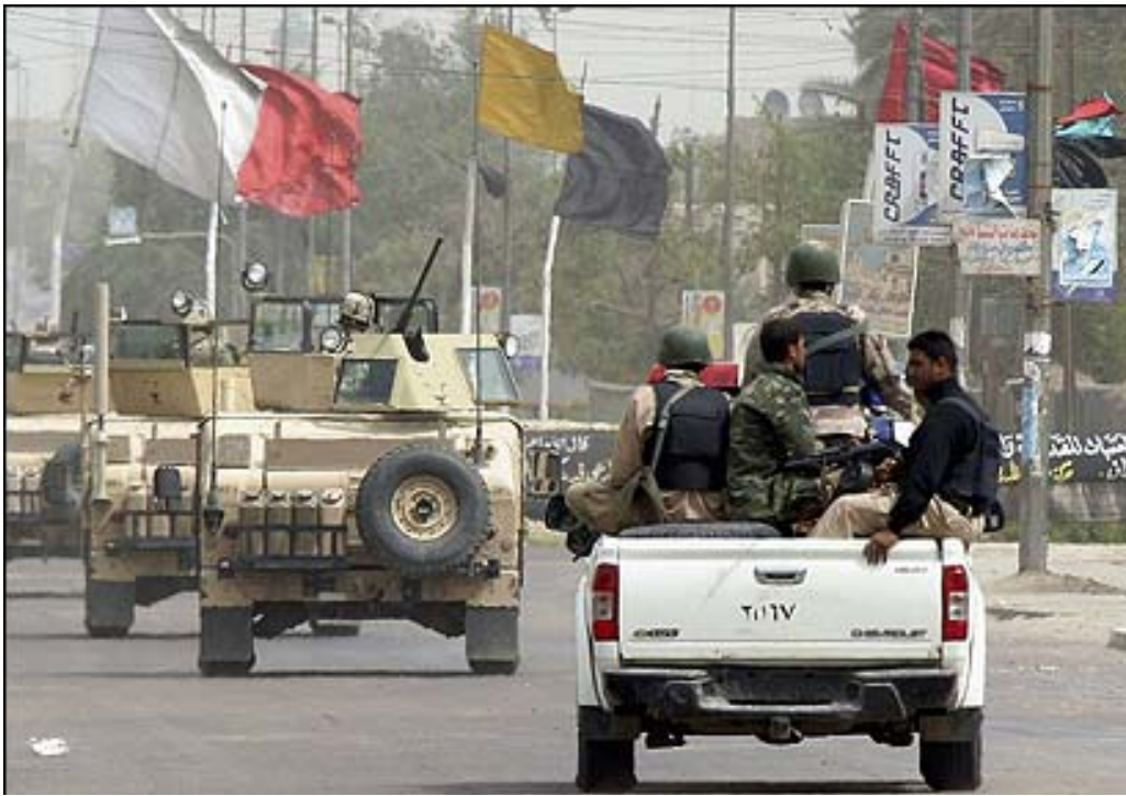
(Special Police Commandos)