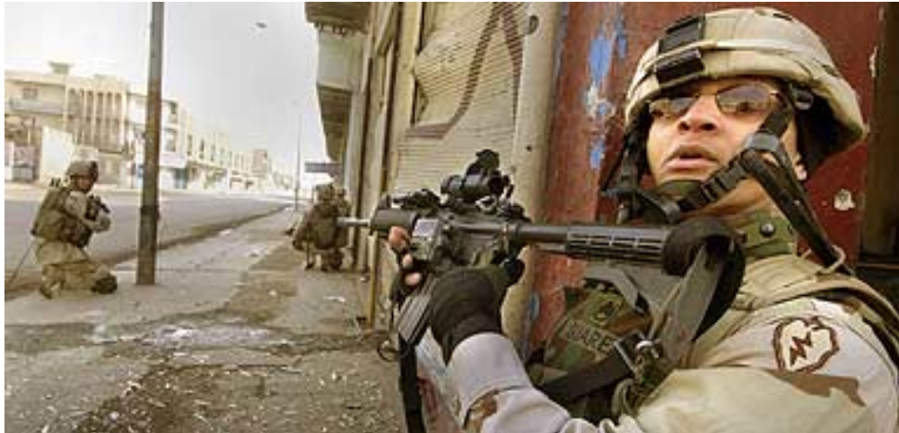
(Task Force Black)

2003 and 2008 as commander of the Joint Special Operations Command, an elite unit so clandestine that the Pentagon for years refused to acknowledge its existence.” The secrecy surrounding these operations prevented more widespread reporting, but as with earlier US covert operations in Vietnam and Latin America, we will learn more about these operations over time.