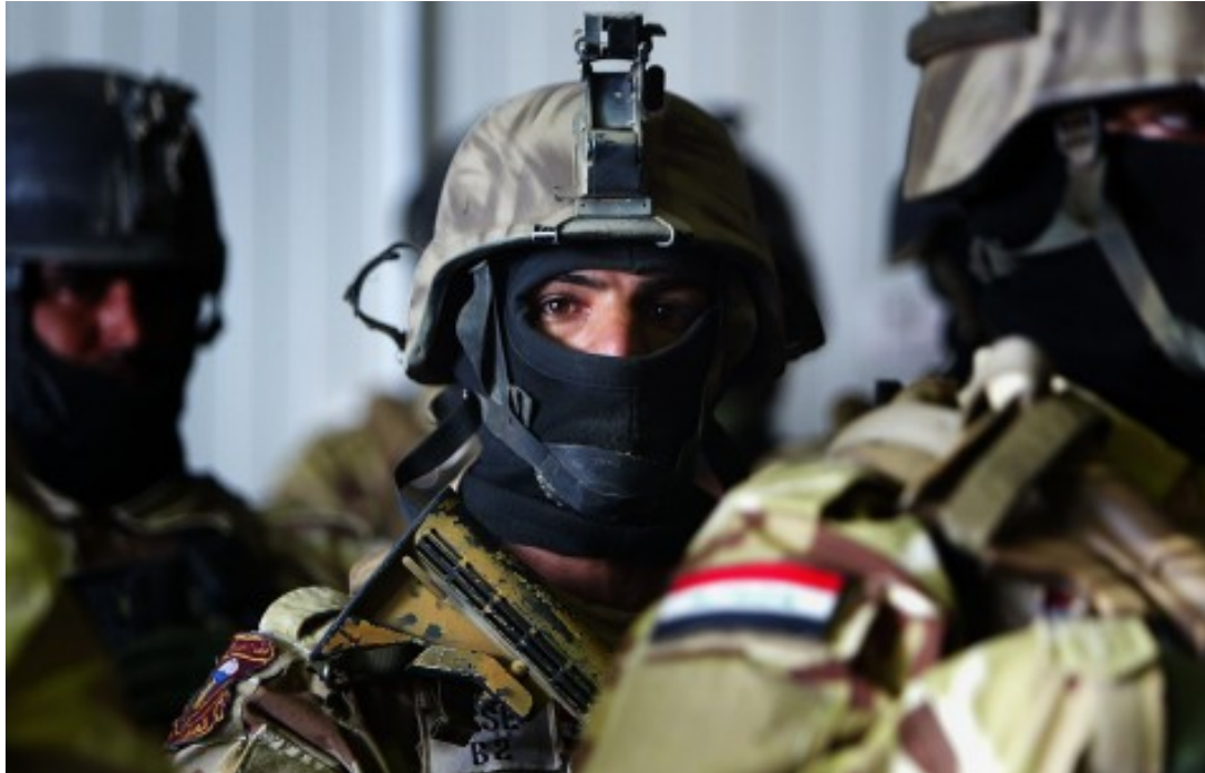
(Iraqi Special Operation Forces)

infusion cell," which will operate independently of Iraq's other intelligence networks. The ISOF is at least 4,564 operatives strong, making it approximately the size of the US Army's own Special Forces in Iraq. Congressional records indicate that there are plans to double the ISOF over the next "several years."