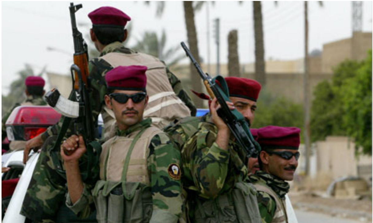
(The Wolf Brigade)

It became clear after the invasion in 2003 that the Iraqi exile groups were to play an important role in the violent response to dissent in occupied Iraq. Already on January 1 st 2004, it was reported that the US government planned to create paramilitary units comprised of militiamen from Iraqi Kurdish and exile groups including the Badr brigades, the Iraqi National Congress and the Iraqi National Accord to wage a campaign of terror and extra-judicial killing, similar to the Phoenix program in Vietnam: the terror and assassination campaign that killed tens of thousands of civilians.