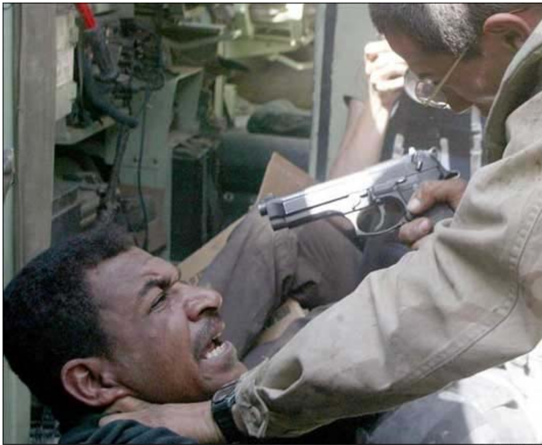
Kamzi Haidar / AFP